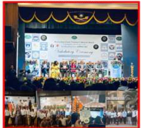
75 TH ANNIVERSARY - HSNB BOARD 16.03.2025