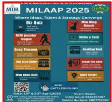
MILAAP-2025 ANNUAL EVENT OF MIM ON 19 TH & 20 TH APRIL, 2025