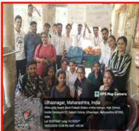
CSR ACTIVITY-VISIT TO OLD AGE HOME-14.02.2025