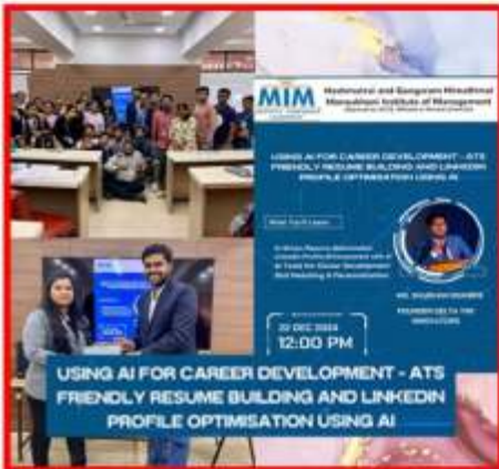
SESSION ON : AI FOR CAREER DEVELOPMENT-ATS FRIENDLY RESUME BUILDING & LINKEDIN PROFILE OPTIMISATION USING AI-22.12.2024