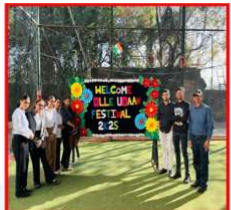
UDAAN-DLE FESTIVAL 12.02.2025