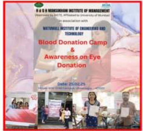
BLOOD DONATION CAMP & AWARENESS ON EYE DONATION-25.02.2025