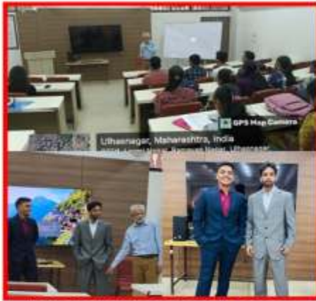
MARKETING STRATEGY & PERSONALITY DEVELOPMENT SESSION-22.02.2025