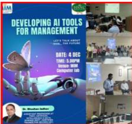
SESSION ON : AI TOOLS FOR MANAGEMENT - 04.12.2024