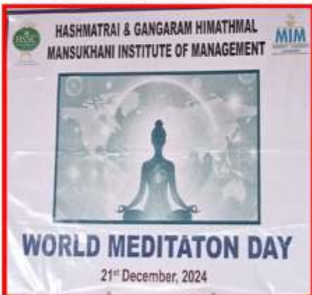
CELEBRATION OF WORLD MEDITATION DAY 21.12.2024